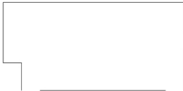
My New Science Classroom/