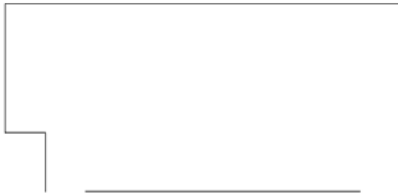
My New Science Classroom/

PowerPoint- lead your students through the lesson click-by-click